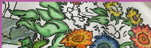
GAF French Impressionism