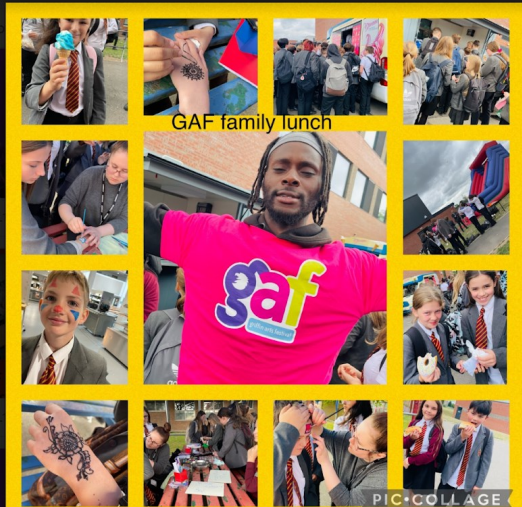
GAF family lunch