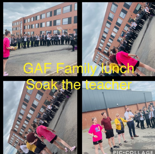
GAF Family lunch Soak the teacher