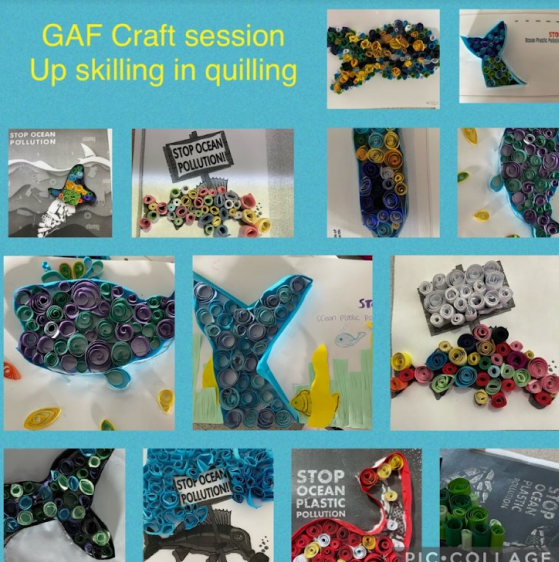
GAF Craft session Up skilling in quilling